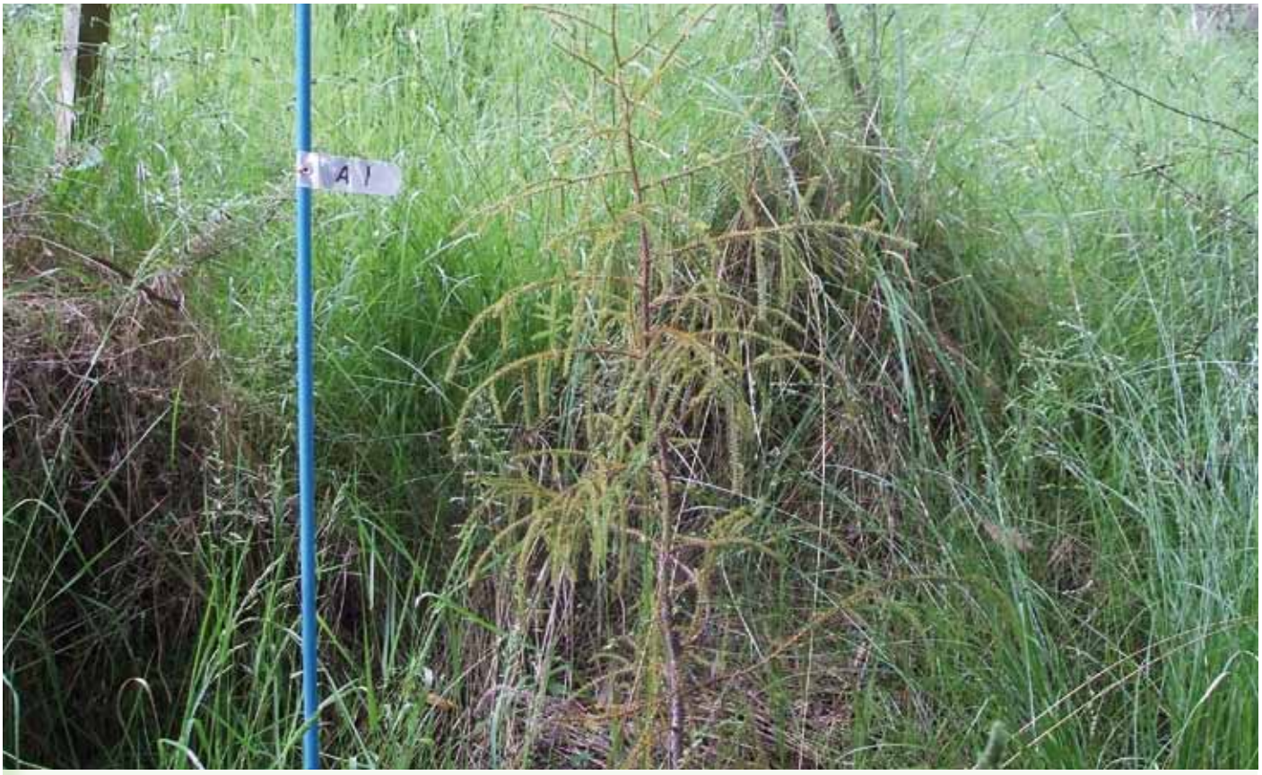
Young rimu with marker cane and unique ID tag.

At Rewanui we are trialling alternative species to radiata pine. Since we began planting our trials in 2006, all trees have been monitored annually. Our aim is to gather information over the long term on tree performance that will be useful to people considering new planting. The information will help guide decisions on what species to plant, where.