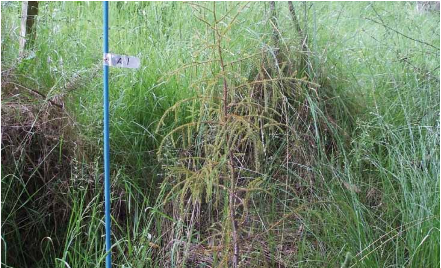
Young rimu with marker cane and unique ID tag.

At Rewanui we are trialling alternative species to radiata pine. Since we began planting our trials in 2006, all trees have been monitored annually. Our aim is to gather information over the long term on tree performance that will be useful to people considering new planting. The information will help guide decisions on what species to plant, where.